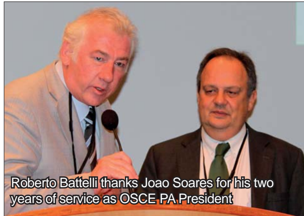
Roberto Battelli thanks Joao Soares for his two years of service as OSCE PA President

At the end of the Plenary, election results