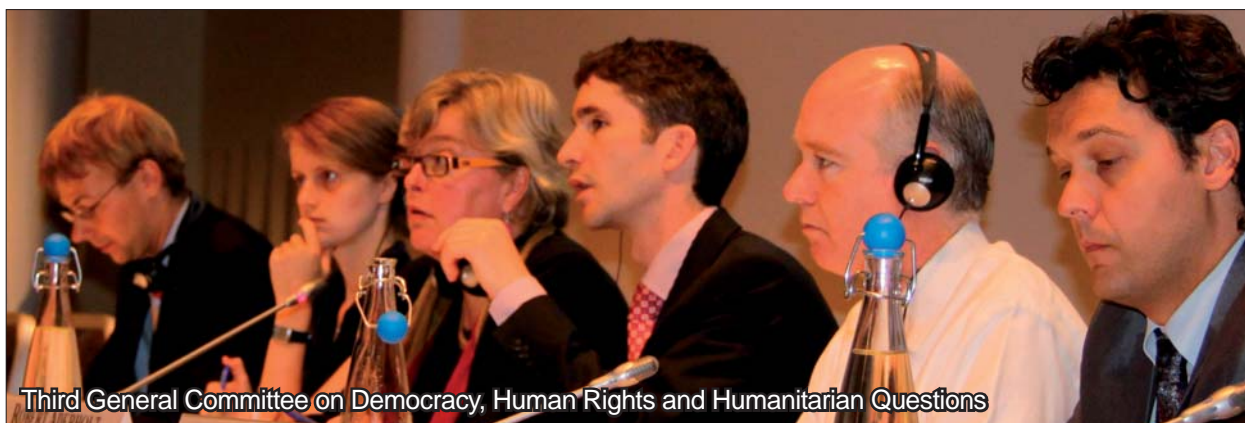
Third General Committee on Democracy, Human Rights and Humanitarian Questions

of the International Pan-European Movement prior to being elected to parliament in 2006.