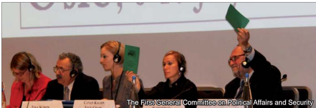
The First General Committee on Political Affairs and Security

One of the most important aspects of the work of the Annual Session is the deliberation that takes place in the three General Committees.