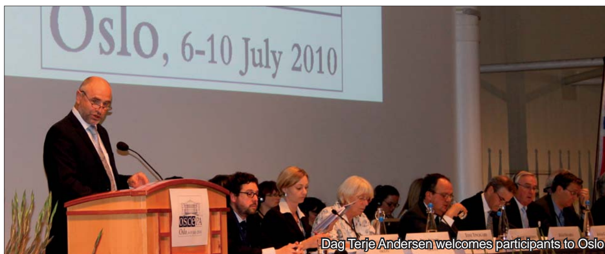
Dag Terje Andersen welcomes participants to Oslo