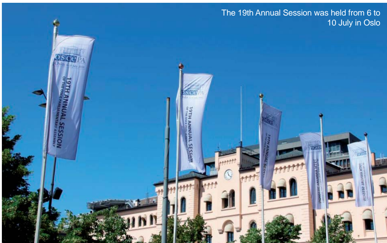
The 19th Annual Session was held from 6 to 10 July in Oslo

Under the general theme of “Rule of Law: Combating Transnational Crime and Corruption,” the OSCE PA’s 19th Annual Session took place from 6 to 10 July in Oslo. Hosted by the Parliament of Norway, the Storting, the Annual Session debated resolutions dealing with various dimensions of the theme, as well as 35 supplementary items covering a wide range of topics. Around 250 parliamentarians participated in the meeting.