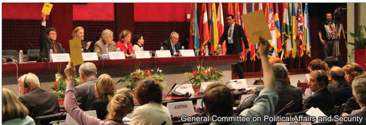
General Committee on Political Affairs and Security

One of the most important aspects of the work of the Annual Session is the deliberation that takes place in the three General Committees.