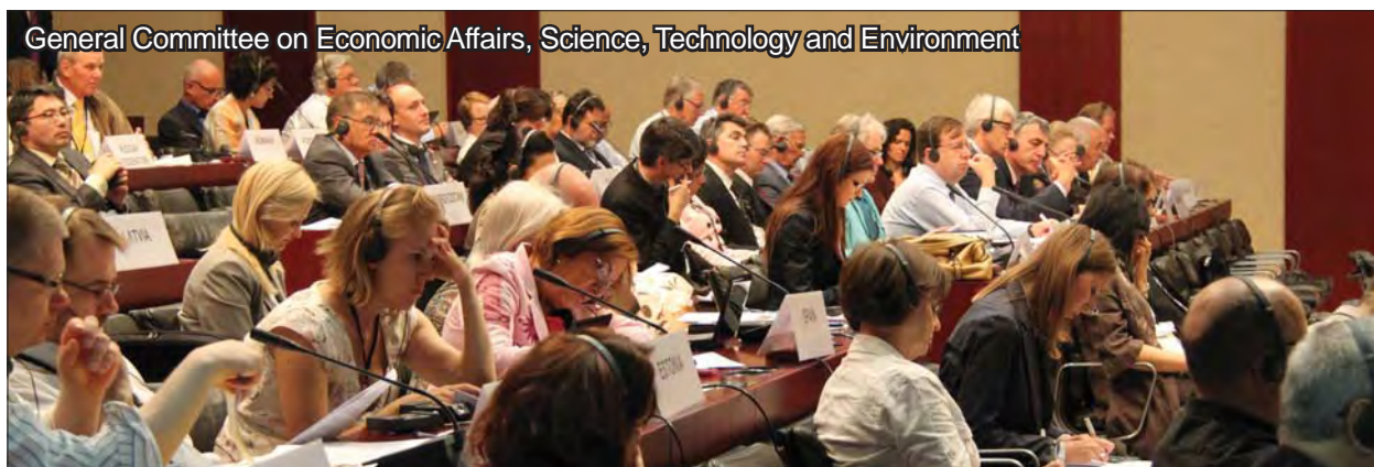
General Committee on Economic Affairs, Science, Technology and Environment