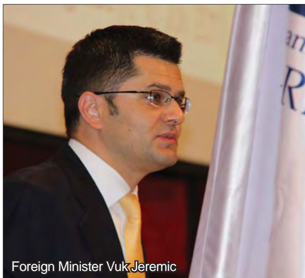
Foreign Minister Vuk Jeremic

Addressing the Plenary Session on 9 July, Serbian Foreign Minister Vuk Jeremic announced that Serbia would seek the Chairmanship of the OSCE in 2014.