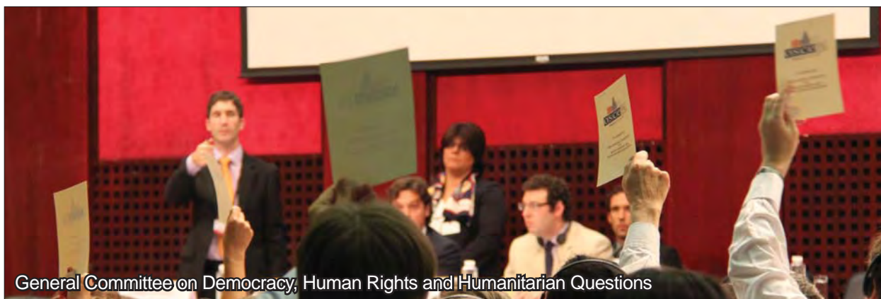
General Committee on Democracy, Human Rights and Humanitarian Questions