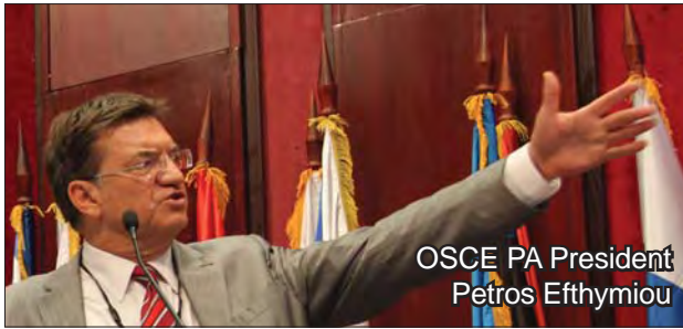
OSCE PA President Petros Efthymiou

At the close of each Annual Session, the Assembly adopts a Declaration with recommendations in the fields of political affairs, security, and economic, environmental and human rights issues, represents the collective voice of the OSCE parliamentarians and helps shape OSCE and national policy.