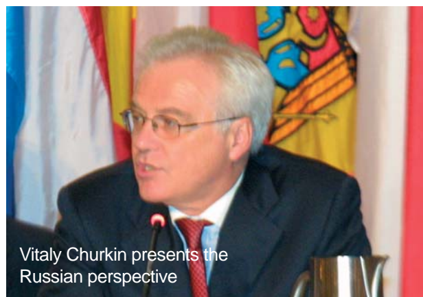
Vitaly Churkin presents the Russian perspective