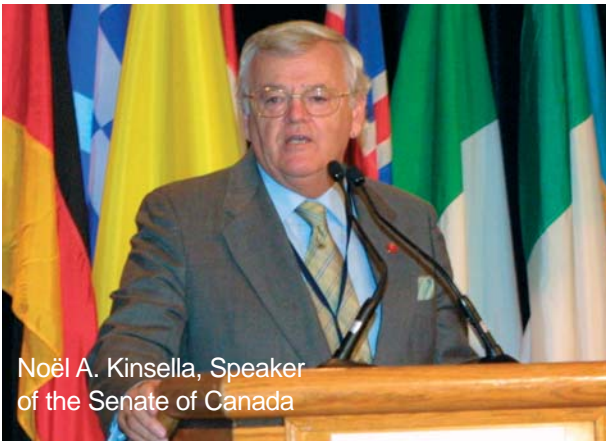
Noël A. Kinsella, Speaker of the Senate of Canada

had reformatted the panel on political-security topics to address this issue. It is our intention to hold a much needed open discussion on the matter, he said, and urged parliamentarians not to lose sight of common purpose and mandate of the OSCE in the course of discussions.