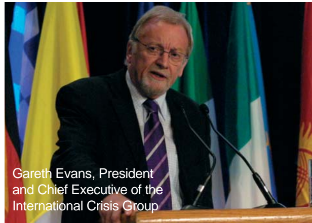
Gareth Evans, President and Chief Executive of the International Crisis Group