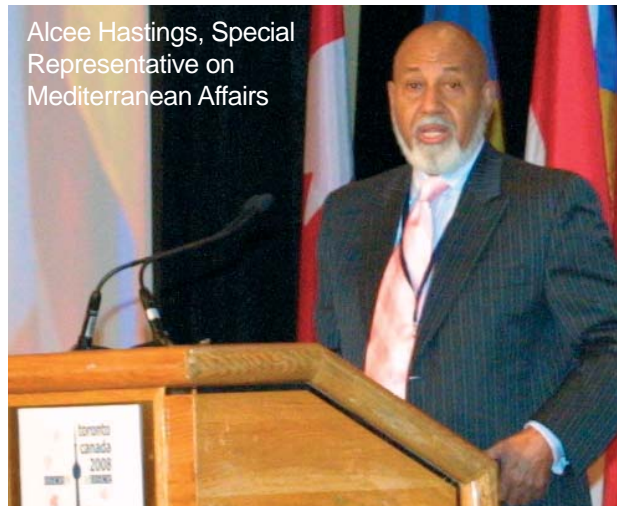
Alcee Hastings, Special Representative on Mediterranean Affairs

Ministry of Foreign Affairs, introduced a French proposal intended to further develop the EU's Euromediterranean Partnership. Entitled the Union for the Mediterranean, the initiative unites all EU members with several non-EU countries that border the Mediterranean Sea, promoting co-operation on energy issues, security, immigration and trade, as well as fighting corruption, terrorism, organized crime and human trafficking.