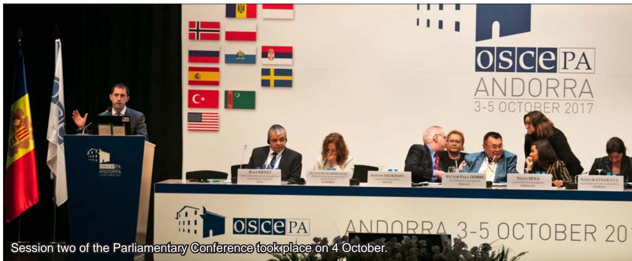
Session two of the Parliamentary Conference took place on 4 October.