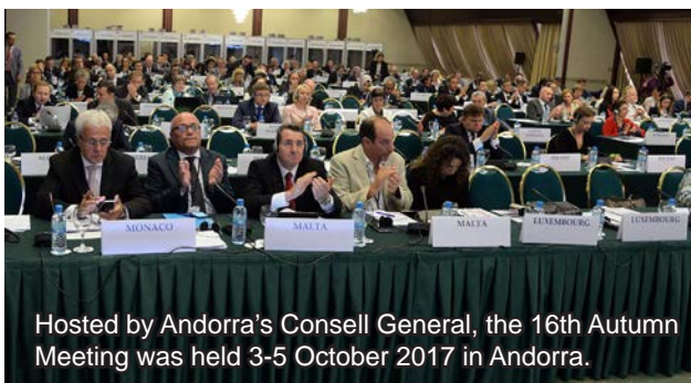
Hosted by Andorra's Consell General, the 16th Autumn Meeting was held 3-5 October 2017 in Andorra.

The OSCE PA holds an Autumn Meeting every year to enhance inter-parliamentary dialogue on OSCE-related topics. Previous meetings have been held in the former Yugoslav Republic of Macedonia, Mongolia, Switzerland, Montenegro, Albania, Croatia, Italy, Greece, Canada, Slovenia, Malta, and Spain.