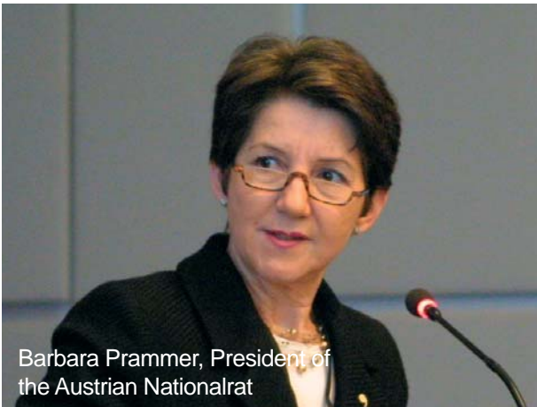
Barbara Prammer, President of the Austrian Nationalrat