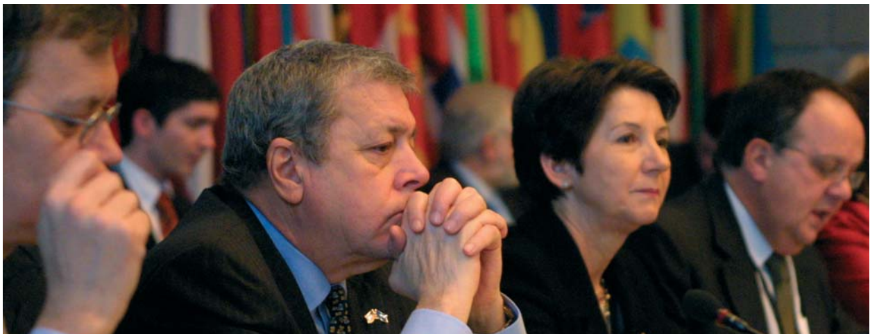
Opening Remarks by Barbara Prammer, President of the Austrian Nationalrat