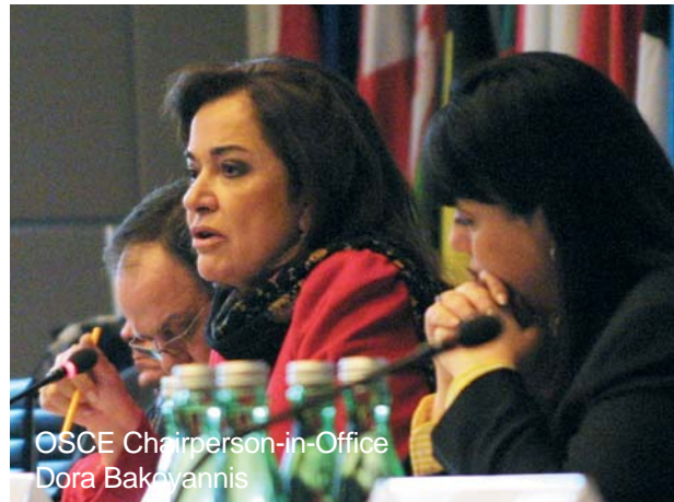
OSCE Chairperson-in-Office Dora Bakoyannis

flexibility to adapt to new realities. He personally expressed his strong belief in the OSCE's potential to meet new challenges. However, Mr. Soares acknowledged that the Organization lacks transparency and that there is a need for the consensus rule to be adjusted. Election observation remains the centerpiece of the work of the OSCE PA, Mr. Soares said, because the expertise of parliamentarians cannot be met by the qualifications of bureaucrats. Additionally, Mr. Soares drew particular attention to the importance of all parties respecting the 1997 Co-operation Agreement on OSCE election observation activities. He concluded by expressing his great hope in the Greek Chairmanship.