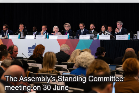
The Assembly's Standing Committee meeting on 30 June