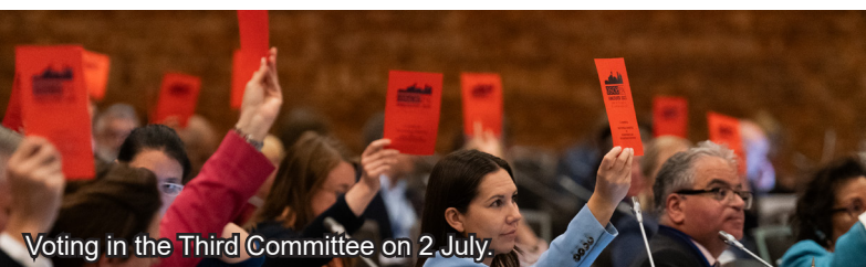
Voting in the Third Committee on 2 July.