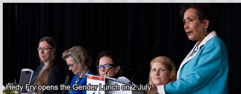
Hedy Fry opens the Gender Lunch on 2 July