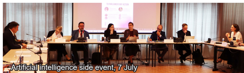
Artificial intelligence side event, 7 July