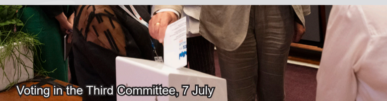
Voting in the Third Committee, 7 July