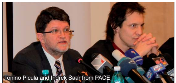
Tonino Picula and Indrek Saar from PACE

Mr. Picula, Head of Croatia’s OSCE PA delegation and