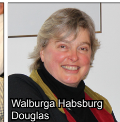
Walburga Habsburg Douglas