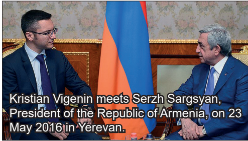
Kristian Vigenin meets Serzh Sargsyan, President of the Republic of Armenia, on 23 May 2016 in Yerevan.