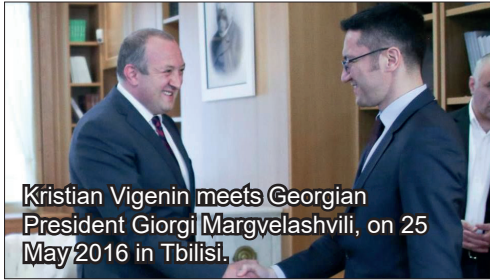
Kristian Vigenin meets Georgian President Giorgi Margvelashvili, on 25 May 2016 in Tbilisi.