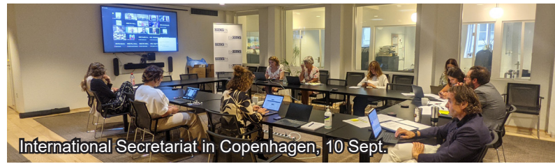
International Secretariat in Copenhagen, 10 Sept.