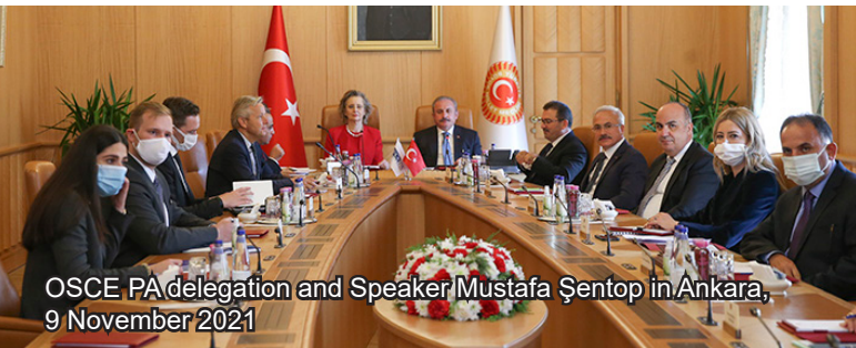
OSCE PA delegation and Speaker Mustafa Şentop in Ankara, 9 November 2021

A high-level delegation from the OSCE PA led by President Margareta Cederfelt (Sweden) and comprising Vice-President Azay Guliyev (Azerbaijan) and Vice-President Reinhold Lopatka (Austria) completed on 13 November an official visit to Turkey.