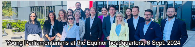
Young Parliamentarians at the Equinor headquarters, 6 Sept. 2024

Meetings were held with representatives from Stavanger Municipality, Stavanger Chamber of Commerce, and major Norwegian energy and climate investment companies—Lyse Energy, Equinor, and Nysnø Climate Investments. The delegation also visited significant energy infrastructure sites, including the Flørlø power station, the Martin Linge platform control room at the