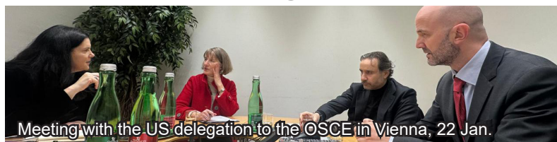
Meeting with the US delegation to the OSCE in Vienna, 22 Jan.