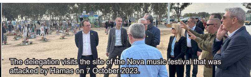
The delegation visits the site of the Nova music festival that was attacked by Hamas on 7 October 2023.