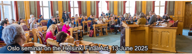
Oslo seminar on the Helsinki Final Act, 13 June 2025

Restoring security and co-operation in a Europe at war was the topic of a seminar held 13 June at the Norwegian Storting in Oslo with the support of Norway's Delegation to the OSCE PA. Focused on how to revitalize the commitment to international norms ahead of the 50th anniversary of the Helsinki Final Act, the event explored the document's ongoing relevance and how to put its principles into action.