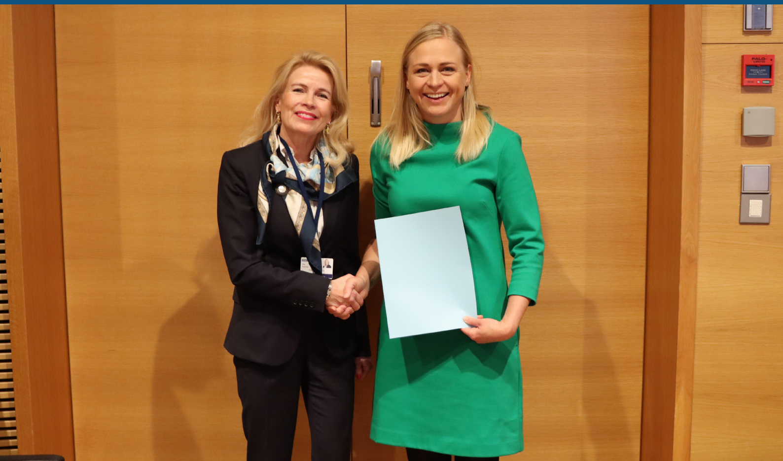
President Pia Kauma presents Finland Minister of Foreign Affairs and OSCE CiO with the OSCE PA's Call for Action document, Helsinki, 24 January 2025