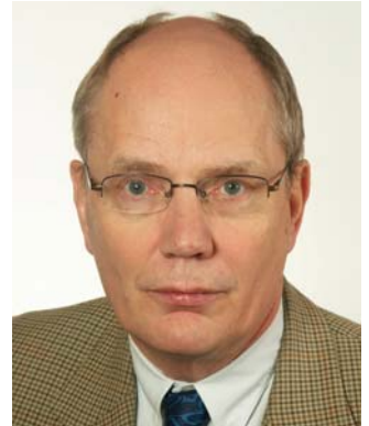
President Goran Lennmarker

President Lennmarker met with a wide range of Cypriot representatives during his visit, including President Dimitris Christofias; the Speaker of Parliament Marios Garoyian; the President of the Northern Cypriots, Mehmet Ali Talat; as well as with Stavros Evagorou, Athina Kyriadou, and Eleni Theocharous, all members of the Cypriot delegation to the OSCE PA.