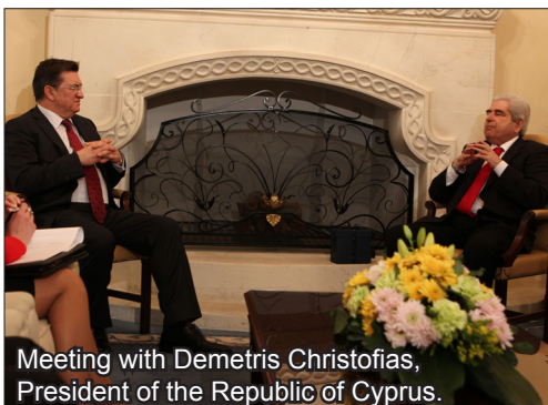
Meeting with Demetris Christofias, President of the Republic of Cyprus.

Efthymiou also discussed Cyprus' upcoming presidency of the Council of the European Union, which begins in July 2012, noting that Cyprus has set solid foundations for its goals.