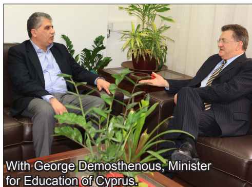
With George Demosthenous, Minister for Education of Cyprus.