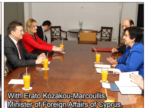
With Erato Kozakou-Marcoullis, Minister of Foreign Affairs of Cyprus.