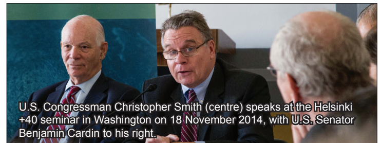
U.S. Congressman Christopher Smith (centre) speaks at the Helsinki +40 seminar in Washington on 18 November 2014, with U.S. Senator Benjamin Cardin to his right.

The International Secretariat is also continuing preparations for the OSCE PA's Helsinki +40 Project. With successful seminars held last year in Moscow and Washington, the Project continues in 2015 with seminars culminating in the final colloquium this July, to be held in Helsinki in conjunction with the 24th Annual Session.