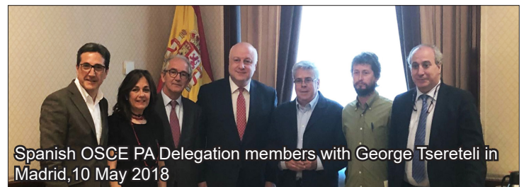
Spanish OSCE PA Delegation members with George Tsereteli in Madrid, 10 May 2018

OSCE PA President George Tsereteli (Georgia) held discussions on 9-10 May in Lisbon and Madrid, meeting, respectively, with Portuguese Secretary of State of Foreign Affairs and Cooperation Teresa Ribeiro and the Spanish Delegation to the OSCE PA. Topics included the upcoming