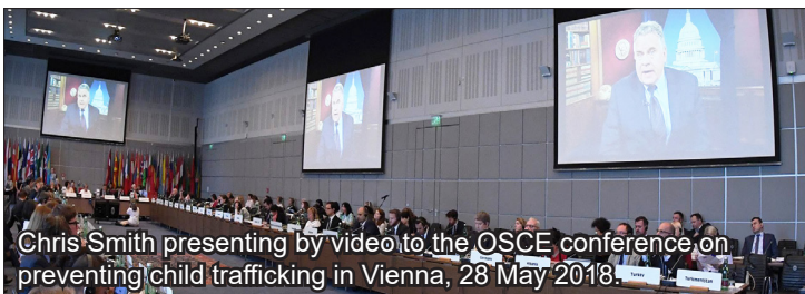
Chris Smith presenting by video to the OSCE conference on preventing child trafficking in Vienna, 28 May 2018

OSCE PA Special Representative on Human Trafficking Issues Christopher Smith (United States) addressed diplomats, civil society, and others by video at the opening of the Supplementary Human Dimension Meeting on Child Trafficking in Vienna on Monday. Smith stressed the need to do more to combat child trafficking, calling on OSCE participating States to implement the 2017 OSCE Ministerial Council Decision on Child Exploitation. He highlighted best practices in this domain, including a U.S. law requiring advance notification of traveling sex offenders.