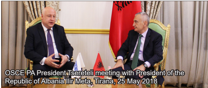
OSCE PA President Tsereteli meeting with President of the Republic of Albania Ilir Meta, Tirana, 25 May 2018