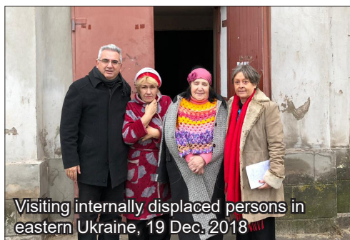
Visiting internally displaced persons in eastern Ukraine, 19 Dec. 2018