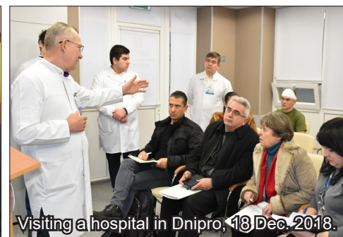
Visiting a hospital in Dnipro, 18 Dec. 2018.