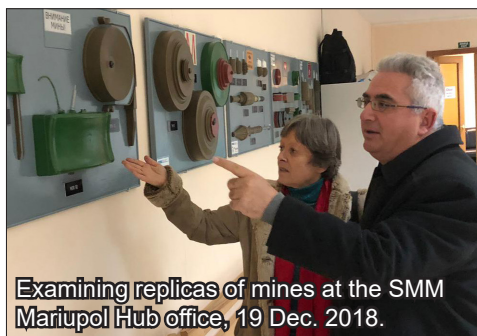
Examining replicas of mines at the SMM Mariupol Hub office, 19 Dec. 2018.