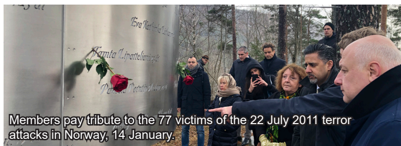
Members pay tribute to the 77 victims of the 22 July 2011 terror attacks in Norway, 14 January.

The delegation also met with members of the Workers Youth League (AUF) and family members of victims of the 22nd July Attack, as well as Norwegian Prime Minister Erna