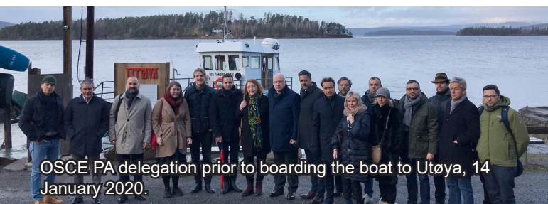
OSCE PA delegation prior to boarding the boat to Utøya, 14 January 2020.