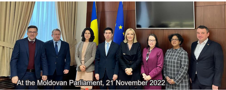
At the Moldovan Parliament, 21 November 2022