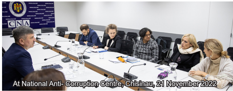
At National Anti-Corruption Centre, Chisinau, 21 November 2022