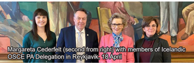
Margareta Cederfelt (second from right) with members of Icelandic OSCE PA Delegation in Reykjavik, 18 April

OSCE PA President Margareta Cederfelt (Sweden) was in Iceland this week, meeting Tuesday with parliamentary and governmental leaders for talks on priority issues facing the OSCE region. The Russian Federation's war against Ukraine featured prominently in discussions, with President Cederfelt and her interlocutors noting the threats posed to the international system by the violations of key international commitments including the UN Charter and the Helsinki Final Act. Meeting with Speaker of the Althingi Birgir Ármannsson and Minister for Foreign Affairs Þórdís Kolbrún Reykjavörð Gylfadóttir, President Cederfelt lauded the active participation of the Icelandic Delegation to the OSCE