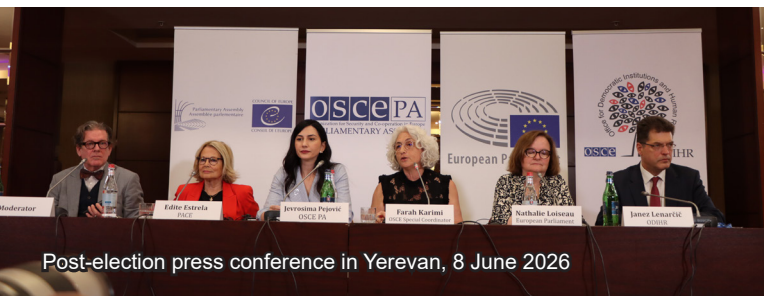
Post-election press conference in Yerevan, 8 June 2026