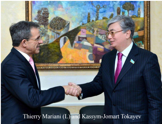
Thierry Mariani (L) and Kassym-Jomart Tokayev