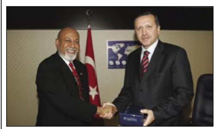
With Prime Minister Erdogan in Ankara