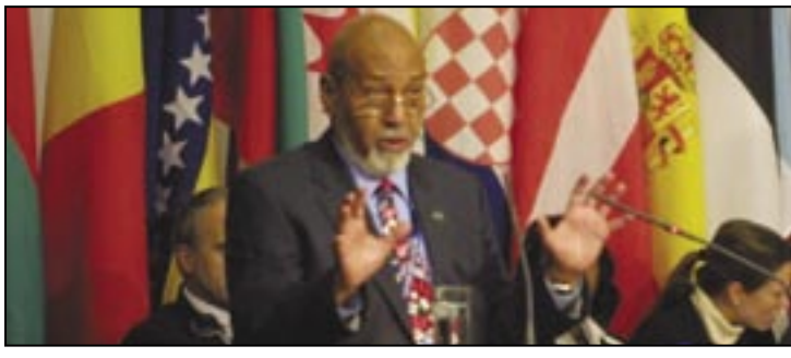
Addressing the OSCE Ministerial Council