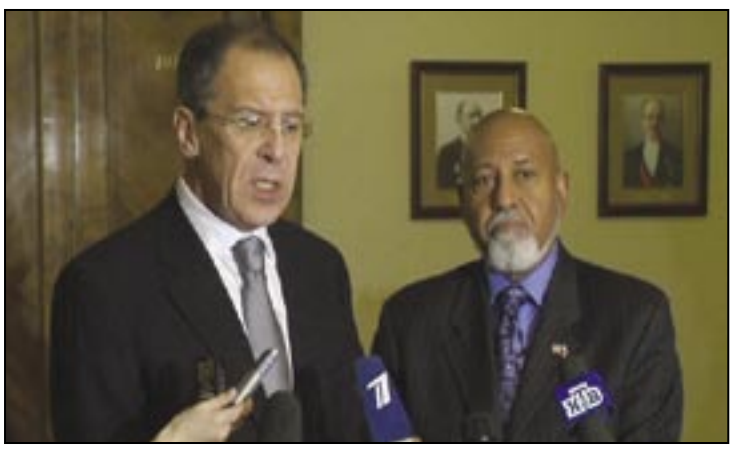
With Russian Foreign Minister Lavrov in Moscow