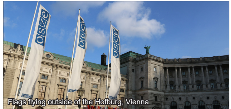
Flags flying outside of the Hofburg, Vienna