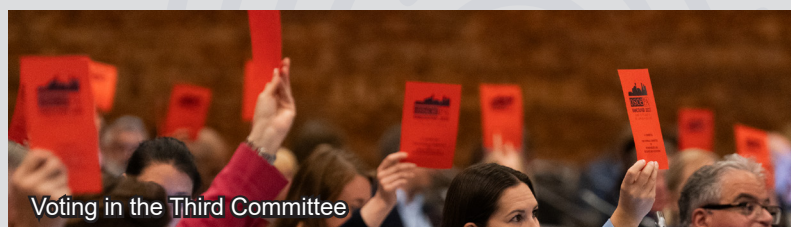
Voting in the Third Committee

More than 225 members of parliament from 50 countries par-