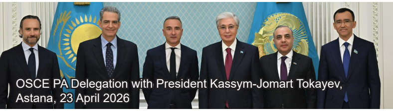
OSCE PA Delegation with President Kassym-Jomart Tokayev, Astana, 23 April 2026