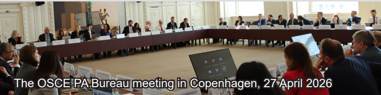
The OSCE PA Bureau meeting in Copenhagen, 27 April 2026