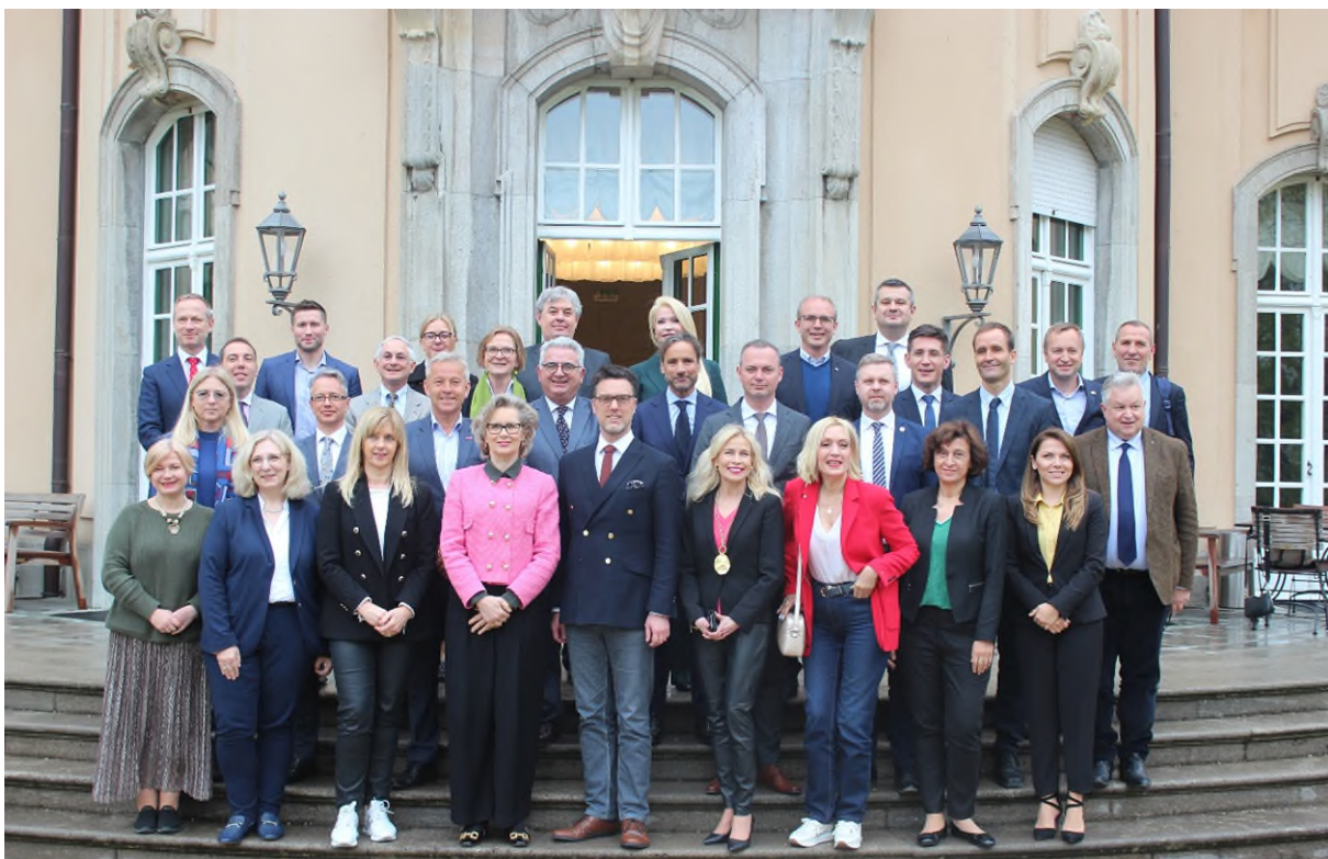
Participants of the Leinsweiler Seminar 05 – 07 May 2023