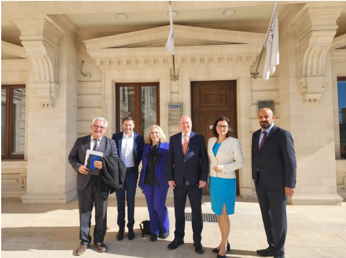
Delegation members of the Migration Committee in Chisinau, March 2023

It emerged clearly that the Republic of Moldova had made great efforts and done a great deal to help people from Ukraine. With its population of some 2.6 million, it had admitted more than 100,000 refugees from Ukraine, about 70% of whom were from the area around Odessa. In terms of percentages of the host population, Moldova has taken in the most refugees of any country. It has also ensured the safe transit of more than 800,000 people to other European countries. The majority of the refugees are concentrated in the capital, Chişinău, and its environs, with more than 90% being housed in dispersed non-collective accommodation or hosted by families in their homes. Among them are many members of especially vulnerable groups, such as unaccompanied minors, elderly people and people with disabilities, Roma and victims of human trafficking and gender-based violence.