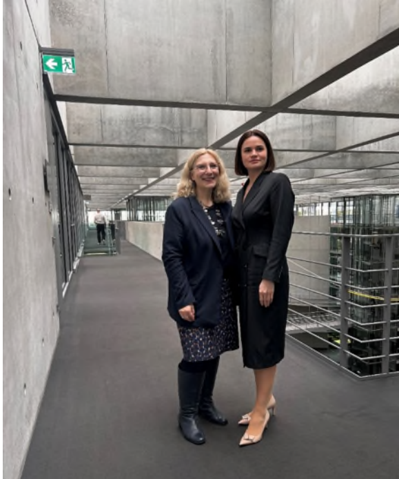
Swetlana Tichanowskaja, former presidential candidate and Belarusian opposition leader

defenders, journalists and others, who can become part of a political patronage scheme. Experiences of political patronage schemes are very encouraging. In numerous documented cases, they have contributed to tangible improvement of the living conditions of individuals adopted into the scheme by arousing critical public sympathy for their personal fate.