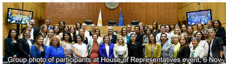
Group photo of participants at House of Representatives event, 6 Nov.