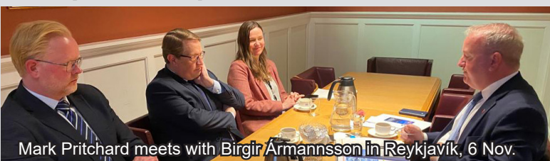
Mark Pritchard meets with Birgir Ármannsson in Reykjavík, 6 Nov.

OSCE PA Vice-President and Special Representative on the Arctic and High North Rt. Hon. Mark Pritchard (United Kingdom) has been in Iceland this week for a series of high-level