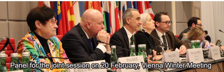
Panel for the joint session on 20 February, Vienna Winter Meeting